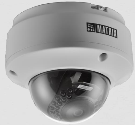
SATATYA CIDR50FL28CWS 5MP IR Dome Camera with 2.8mm Lens

Matrix Project Series IP Cameras are built using superior components such as Sony STARVIS sensor and higher MTF lens to offer unmatched image quality especially during the low light conditions. Powered by True WDR algorithm, these cameras offer consistent image quality even in highly varying lighting conditions. Built in intelligent analytics including Intrusion Detection, Trip Wire, etc. ensure real-time security. Moreover, H.265 compression and Automatic Motion based Frame Rate Reduction save bandwidth and storage up to 50%.