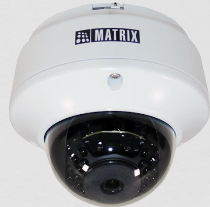
SATATYA CIDR20FL36CWS 2MP IR Dome Camera with 3.6mm Lens

Matrix Project Series Dome IP Cameras are built using superior components such as Sony STARVIS sensor and high MTF lens to offer unmatched image quality especially during the low light conditions. Powered by True WDR algorithm, these cameras offer consistent image quality even in highly varying light conditions. Built in intelligent analytics including Motion Detection, Intrusion Detection, Trip Wire, etc. ensure real-time security. Moreover, H.265 compression and Automatic Motion based Frame Rate Reduction save bandwidth and storage up to 50%.