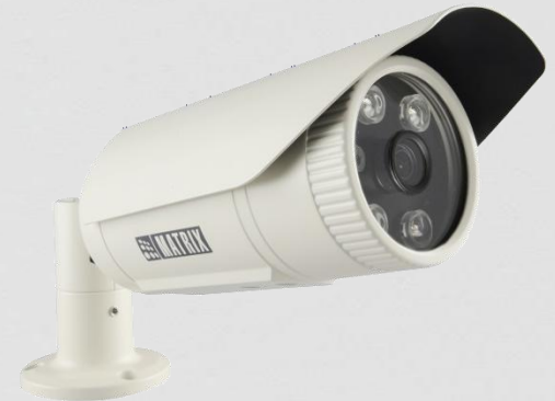
SATATYA CIBR50FL60CWP 5MP IR Bullet Camera with 6mm Lens

Matrix Project Series IP Cameras are built using superior components such as Sony STARVIS sensor and higher MTF lens to offer unmatched image quality especially during the low light conditions. Powered by True WDR algorithm, these cameras offer consistent image quality even in highly varying lighting conditions. Built in intelligent analytics including Intrusion Detection, Trip Wire, etc. ensure real-time security. Moreover, H.265 compression and Automatic Motion based Frame Rate Reduction save bandwidth and storage up to 50%.