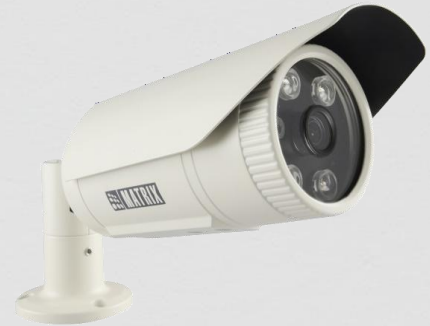
SATATYA CIBR20FL36CWS 2MP IR Bullet Camera with 2.8mm Lens

Matrix Project Series IP Cameras are built using superior components such as Sony STARVIS sensor and higher MTF lens to offer unmatched image quality especially during the low light conditions. Powered by True WDR algorithm, these cameras offer consistent image quality even in highly varying lighting conditions. Built in intelligent analytics including Intrusion Detection, Trip Wire, etc. ensure real-time security. Moreover, H.265 compression and Automatic Motion based Frame Rate Reduction save bandwidth and storage up to 50%.