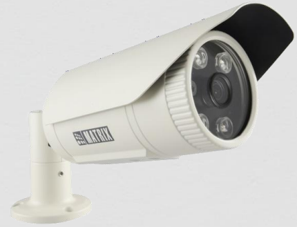
SATATYA CIBR20FL36CWP 2MP IR Bullet Camera with 3.6mm Lens with Audio

Matrix Project Series IP Cameras are built using superior components such as Sony STARVIS sensor and higher MTF lens to offer unmatched image quality especially during the low light conditions. Powered by True WDR algorithm, these cameras offer consistent image quality even in highly varying lighting conditions. Built in intelligent analytics including Intrusion Detection, Trip Wire, etc. ensure real-time security. Moreover, H.265 compression and Automatic Motion based Frame Rate Reduction save bandwidth and storage up to 50%.