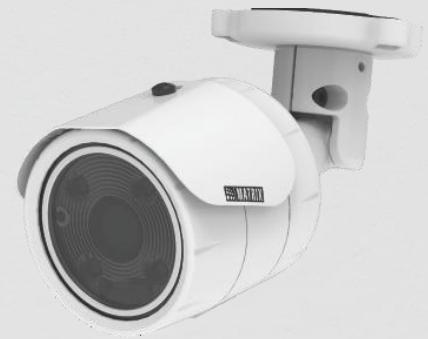
SATATYA MIBR50FL28CWP 5MP IR Bullet Camera with 2.8mm Lens with Audio

Matrix Professional Series IP Cameras are built using superior components such as Sony STARVIS sensor and higher MTF lens to offer unmatched image quality especially during the low light conditions. Powered by True WDR algorithm, these cameras offer consistent image quality even in highly varying lighting conditions. Built in intelligent analytics including Intrusion Detection, Trip Wire, etc. ensure real-time security. Moreover, H.265 compression and Automatic Motion based Frame Rate Reduction save bandwidth and storage up to 50%.