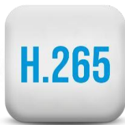
H.265 Compression Technique