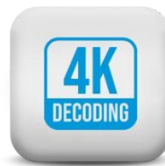
4K Decoding Technique