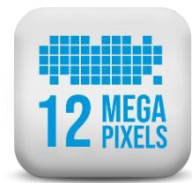
12MP Recording Capacity